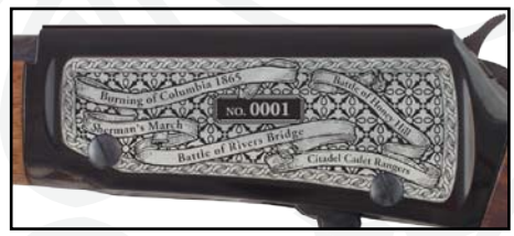
H004 "Golden Boy"