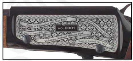
H004 "Golden Boy"