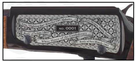
H004 "Golden Boy"